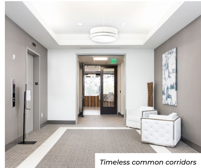
Timeless common corridors