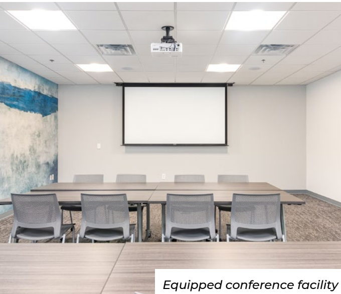
Equipped conference facility

Designed with state-of-the-art systems and equipped conference facility